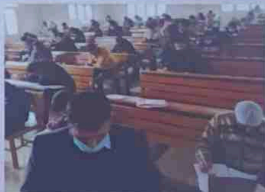
Candidates in the Panchayat Accounts Assistant Examination at GDC Kilam